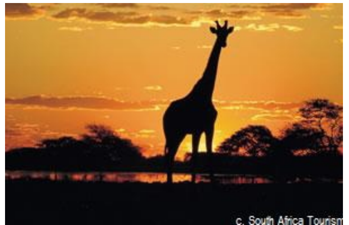
c. South Africa Tourism

It is normal to tip for good service in bars and restaurants in South Africa. Guests may also consider tipping their guide at their discretion.